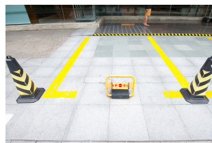
Private parking management